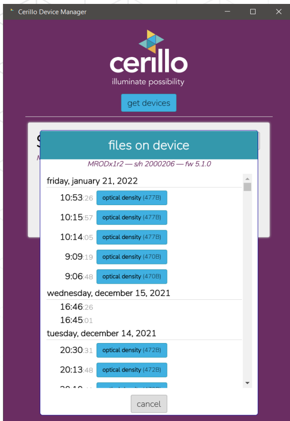
Figure 2. File Storage is easily accessed via the Cerillo Device Manager which allows data to be exported and saved for analysis.

The Bradford assay standard curves were analyzed for quality using a 4-parameter logistic-fit curve. The plotted results show the expected relationship between BSA and BGG (Figure 3). There is low variability between sample replicates and a good curve fit. The ratio between BSA and BGG concentrations is representative of the known offset of 0.56 determined by ThermoScientific™. This indicates that the Stratus produces accurate and highly precise measurements for total protein concentration. A comparison with data from other spectrophotometers on the market revealed equivalent results, confirming the performance of the Stratus is comparable to other absorbance-based microplate readers.